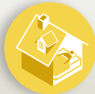
Stay at home